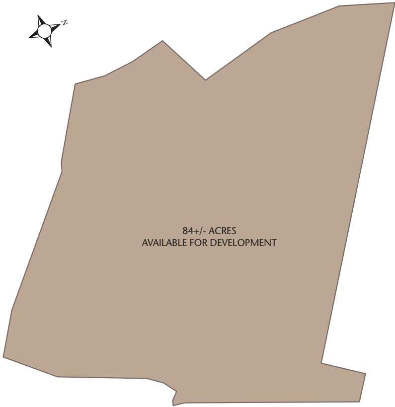
NYS ROUTE 9